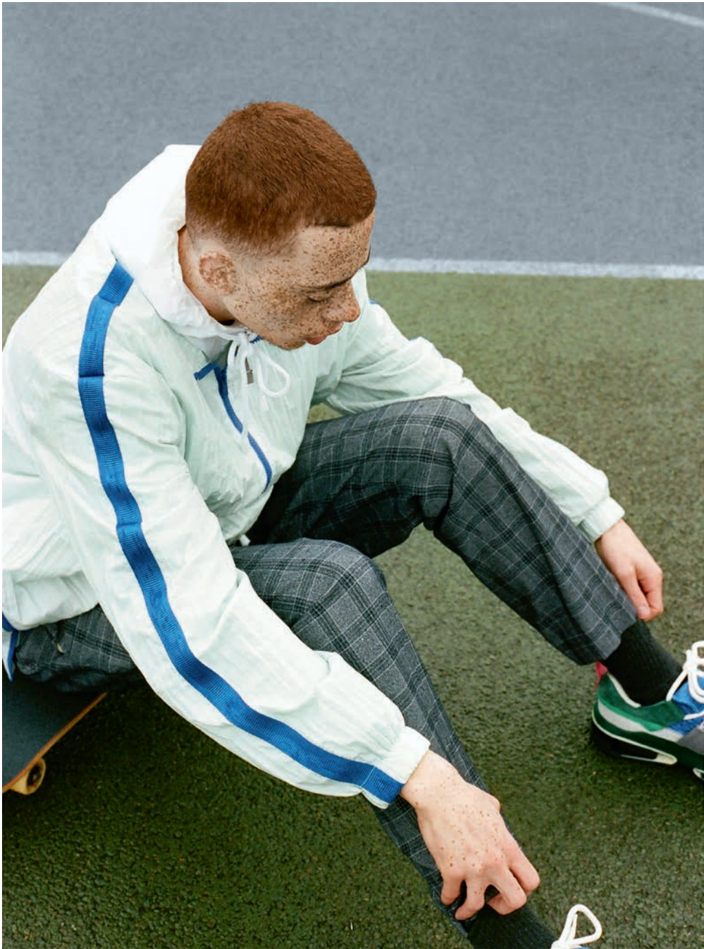
THIS PAGE: ASOS DESIGN WHITE PULLOVER WITH BLUE TAPING [coming soon]; RECLAIMED VINTAGE REVIVED WINDBREAKER WITH BACK PRINT £45; ASOS SKINNY CROP TROUSERS IN GREY CHECK £30; ASOS SPORTS SOCKS IN BLACK BASE [5 Pack] £10; ADIDAS TWINSTRIKE TRAINERS [from ASOS Looped] OPPOSITE: WOOD WOOD BRANDON SHIRT WITH ALL OVER SOMEBODY PRINT £100; POLO RALPH LAUREN SLIM-FIT STRIPED SMART SHIRT £95; ASOS DESIGN CREW-NECK T-SHIRT £6; ICON BRAND SILVER CHAIN NECKLACE £13

WOODS: FELICIA PENNANT. STYLING: JO GREASELY. GROOMING: JOSH KNIGHT AT CAREN. ELLIOTT JAY BROWN AT WILHELMINA